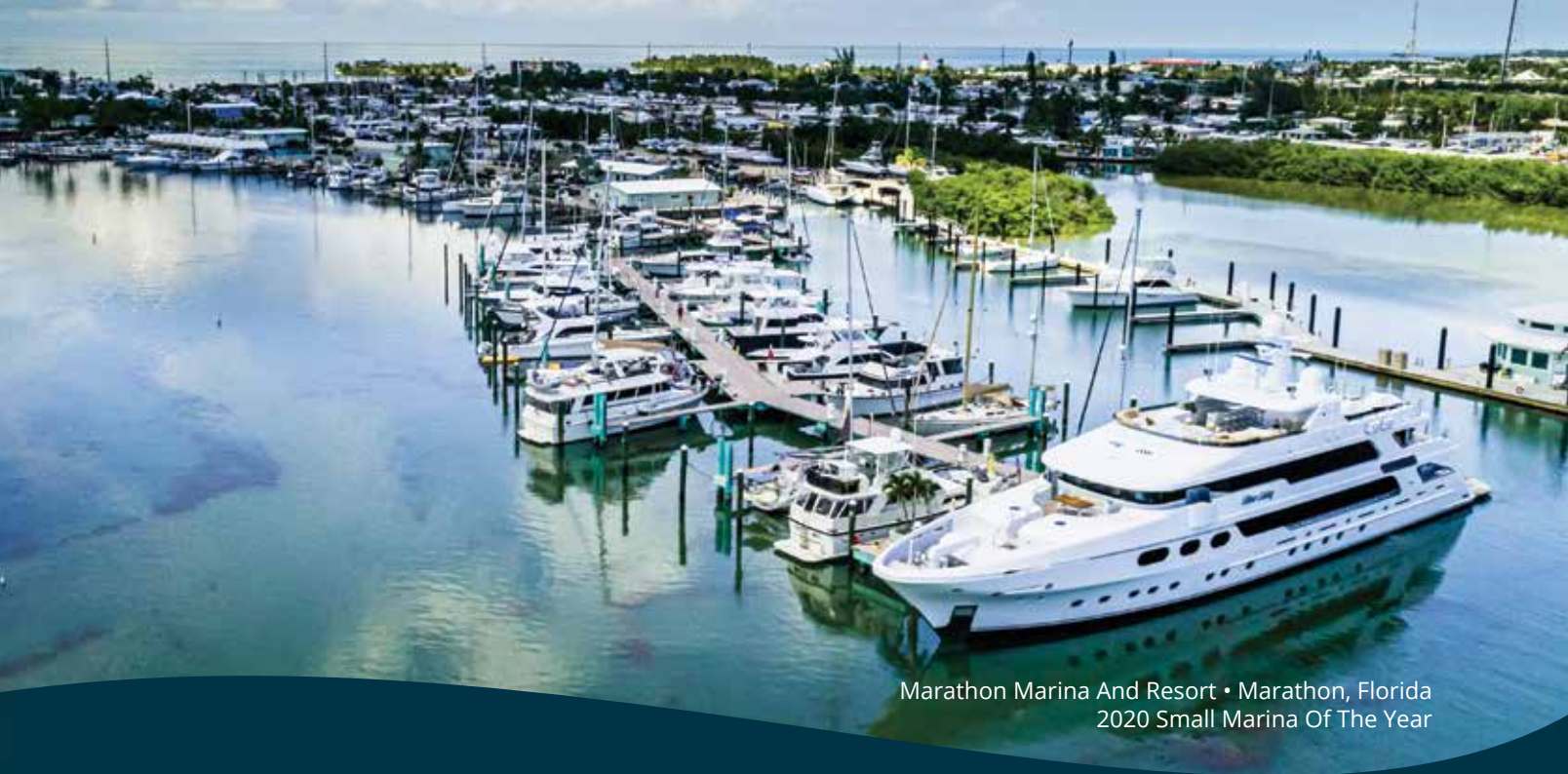
Marathon Marina And Resort • Marathon, Florida 2020 Small Marina Of The Year