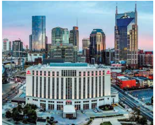
Hilton Downtwon Nashville

The Docks team has secured special rates for attendees and exhibitors at four nearby hotels . Please make your reservation using the links provided on this webpage or by calling the hotel directly. You may report any unauthorized solicitation to jenn@wjinc.net .