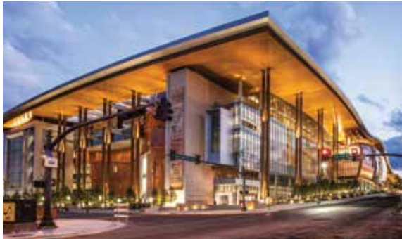
Docks' home-base, Music City Center

Make sure to check out daily product demos too! Plus, don't miss daily on-site coffee breaks, happy hours and even a Bloody Mary bar .