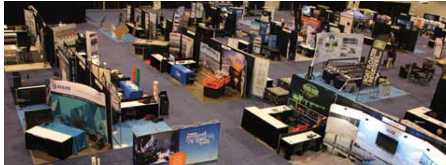
2018 tradeshow floor