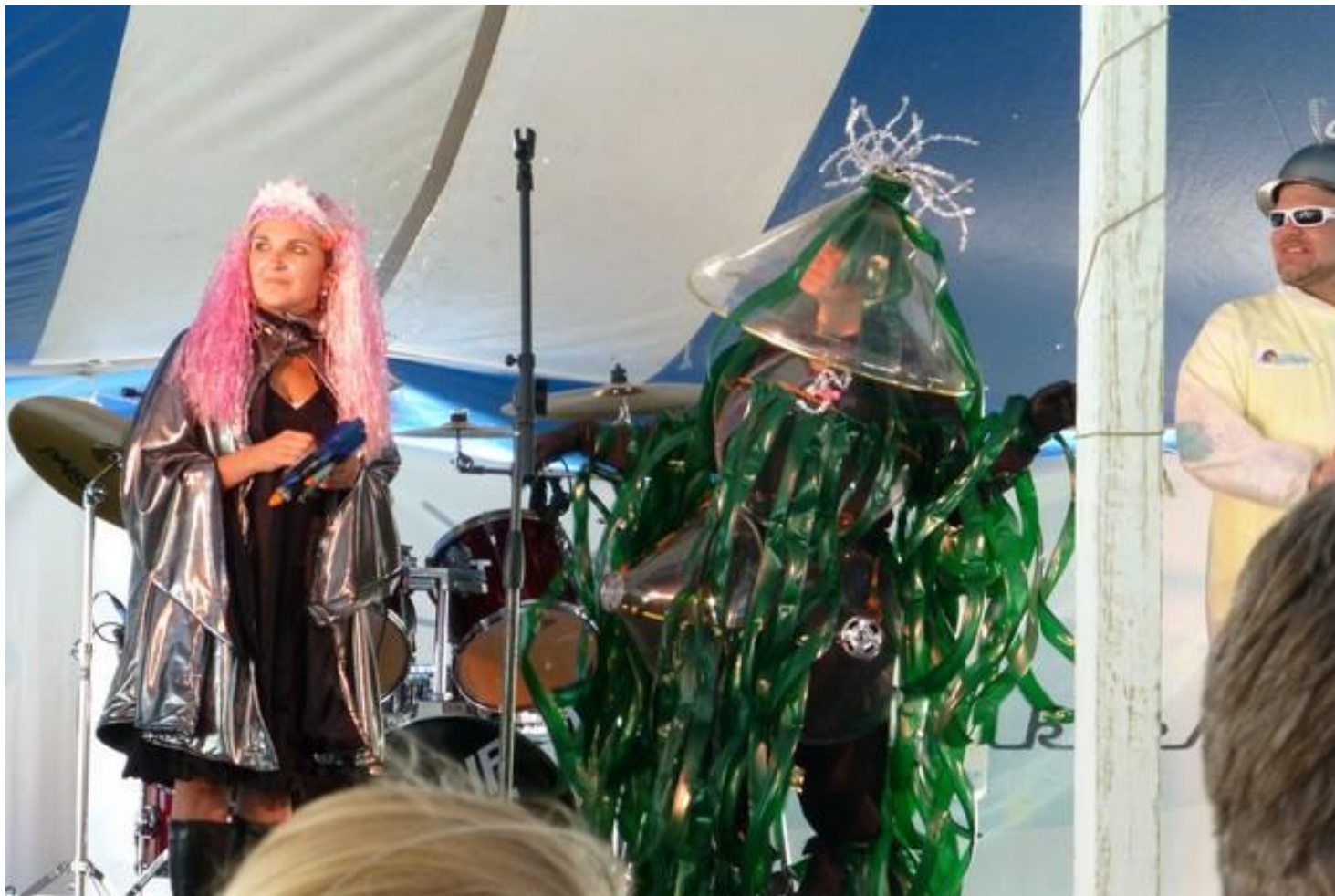
Sputnik Festival – Manitowoc, WI St. Paul Bay – Kingston, ON