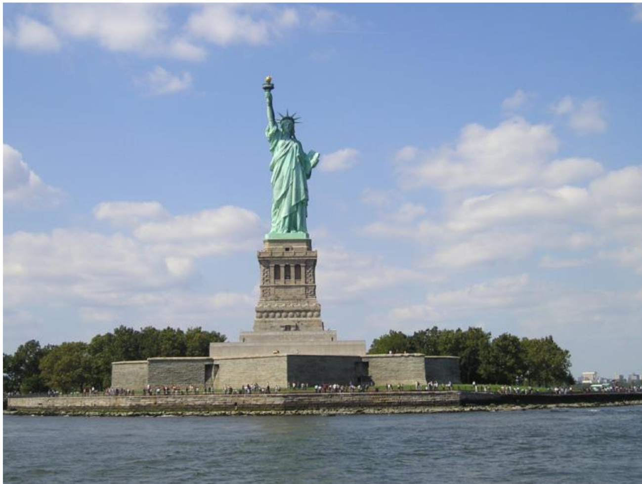
Statue of Liberty