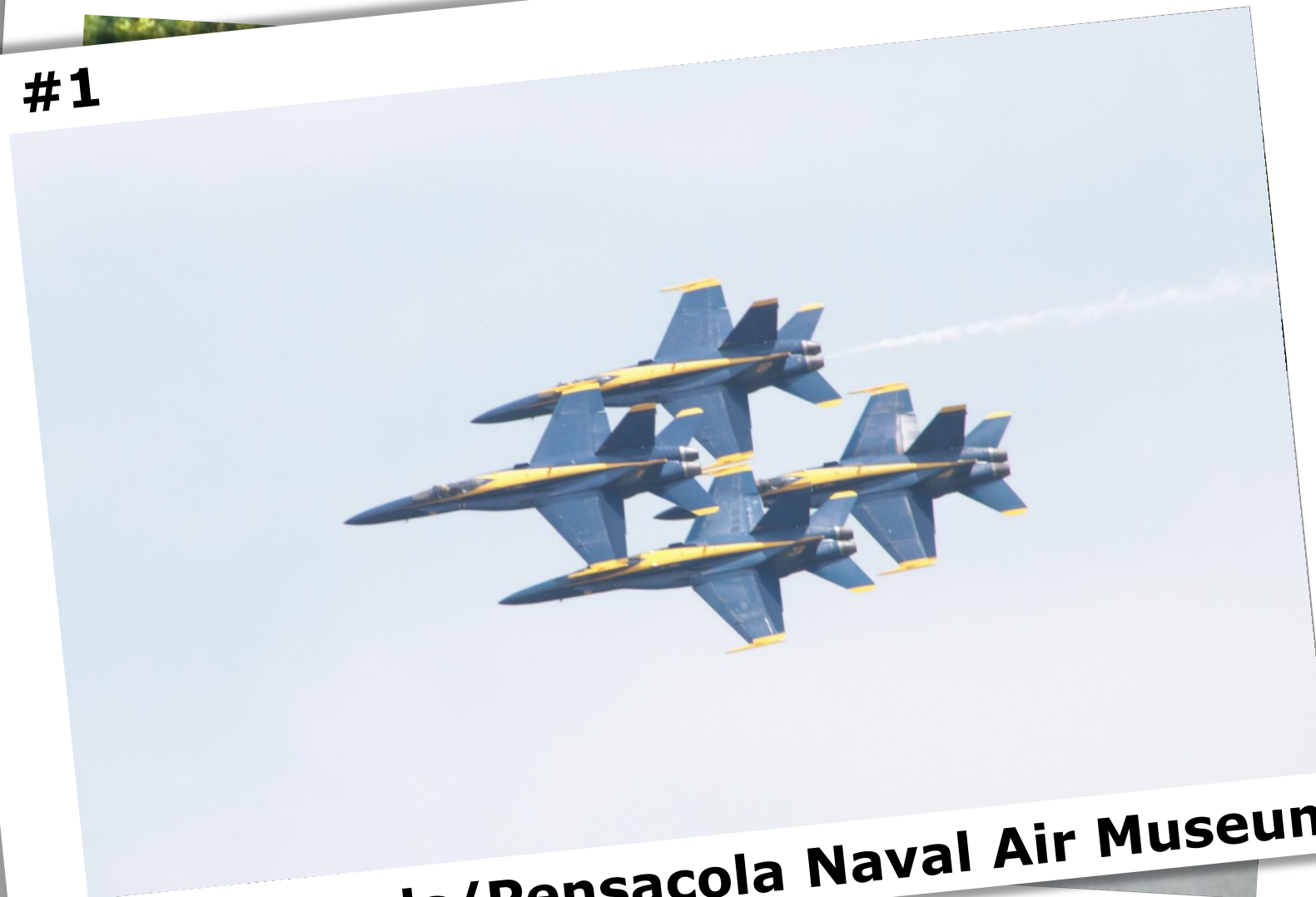
Blue Angels/Pensacola Naval Air Museum Gulf County, WI