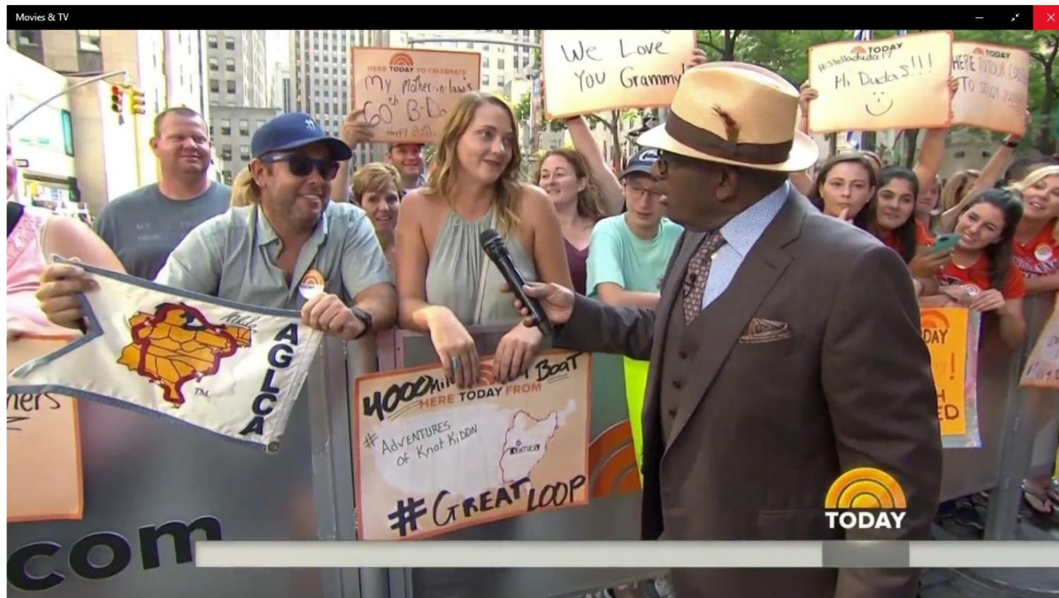
The Today Show