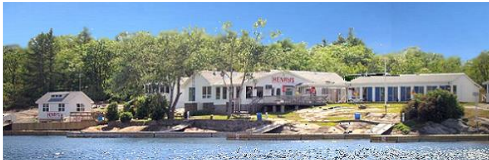
Henry's – Frying Pan Island ( henrysfishrestaurant.com )

Culinary Institute of America – Hyde Park, NY