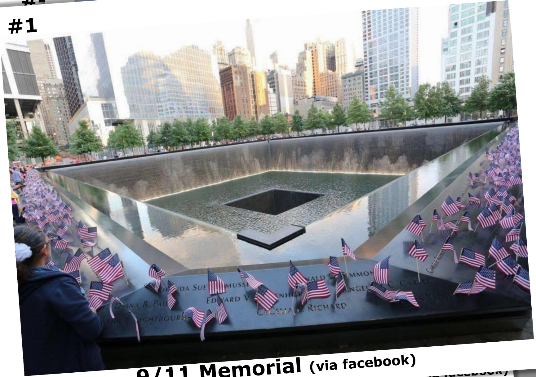
9/11 Memorial